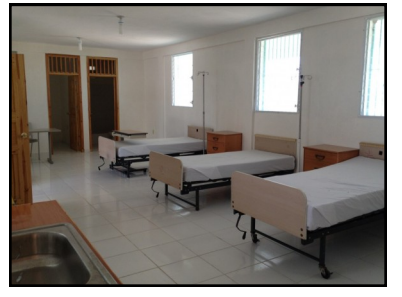
New Infirmary offers overnight accommodations for children.

to our own residents, staff, villagers, and pediatric cases from the nearby birthing center.